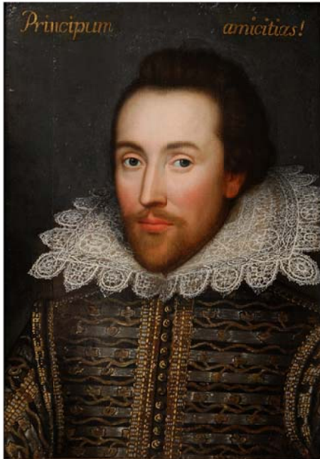
[portrait by an unknown artist from about 1610, Cobbe Collection]

picture acknowledgements: Cobbe Portrait: reproduced by agreement between The Shakespeare Birthplace Trust and the copyright holders; Chandos Portrait: reproduced under the Creative Commons License